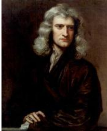
Isaac Newton by Godfrey Kneller